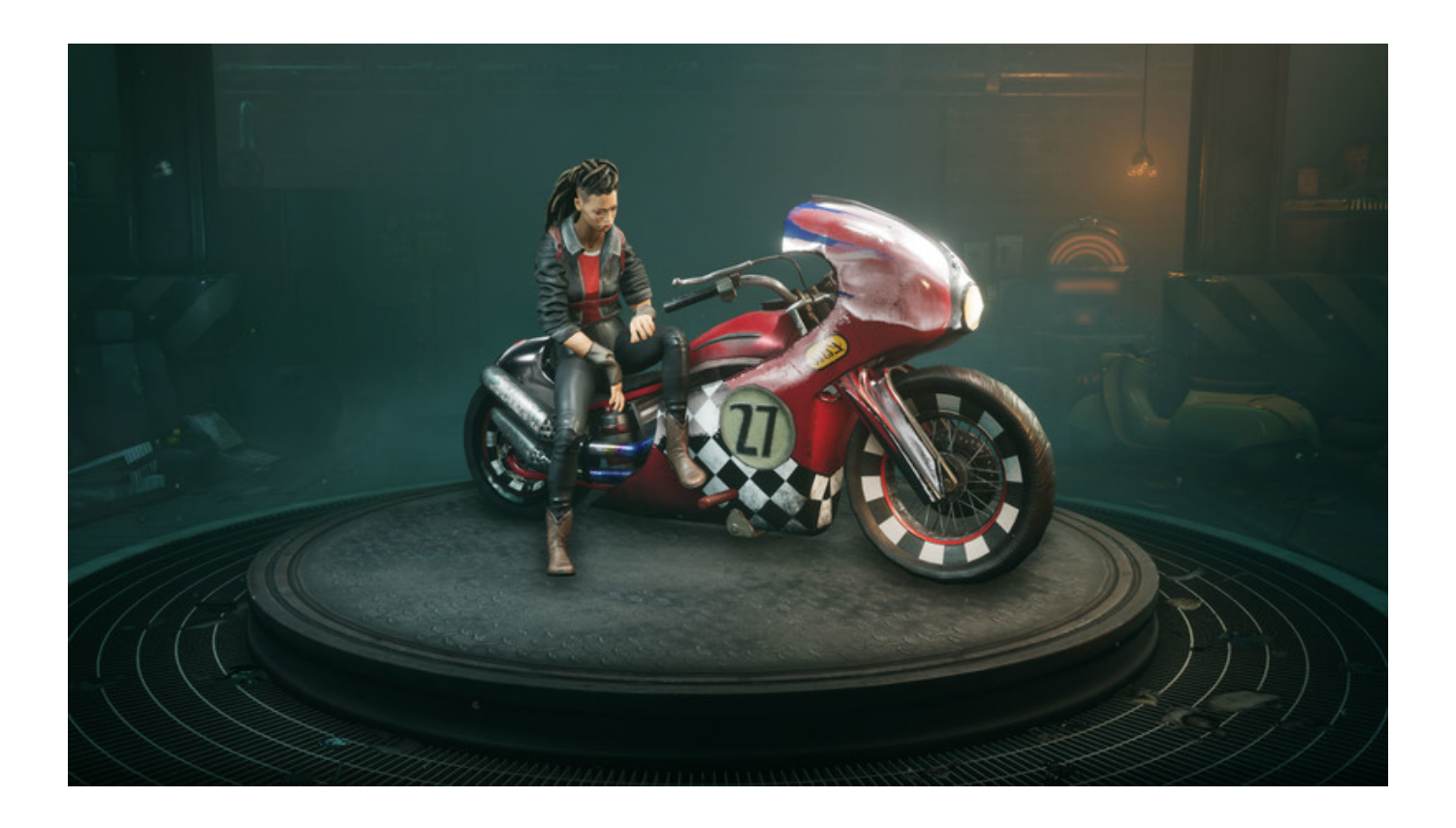
My Ex-Boyfriend The Space Tyrant Download] [key]

Download >>> <a href="http://bit.lv/2NHJfeY">http://bit.lv/2NHJfeY</a>